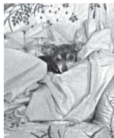
Snug as a bug!

When you adopt a “pet without a partner,” you will forever make a difference in their life and they are sure to make a difference in yours. •