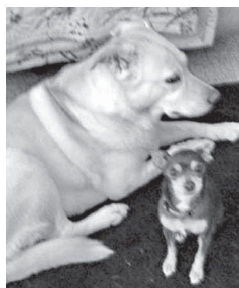
Gidget finds a friend.

“Thank you for the pictures. Gidget is spoiled already. She is not housebroken or pad-trained. We have had many accidents, but I know it takes longer to train a Chihuahua than other breeds and are not worried about it. Sometimes she doesn't go outside and waits to go inside, but in time that will pass. She is on a leash out in back when we take her out and she does quite well really. She knows her beds (yes, one upstairs and one downstairs)--the one upstairs is on our bed between our pillows, so she runs up on the bed and climbs into her bed at night. What's really cute is her sleeping in clean clothes