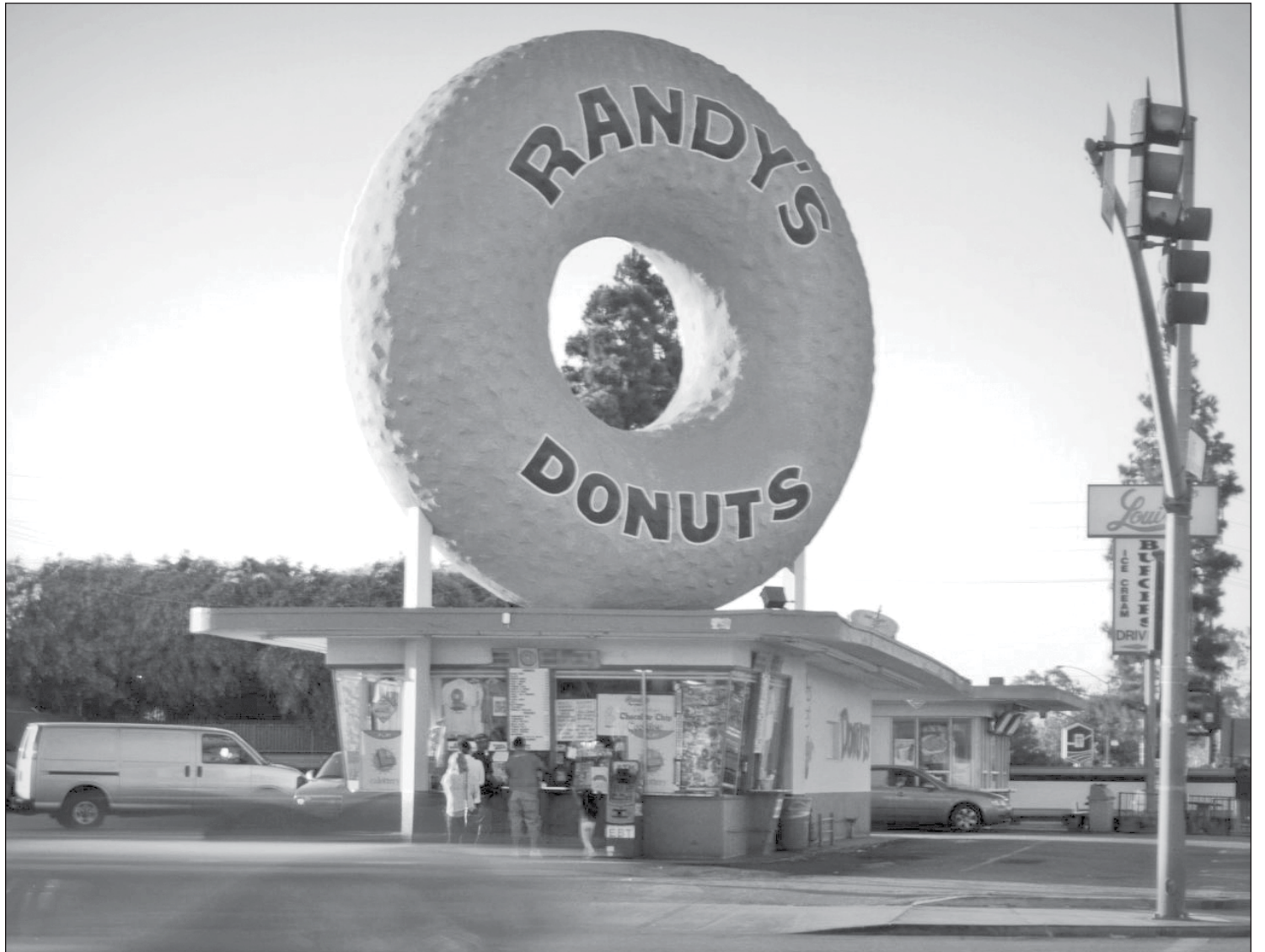
As much of a Los Angeles landmark as the Hollywood sign, Randy's Donuts, which is located in Inglewood, California, near Los Angeles International Airport, has been in business for over 60 years.